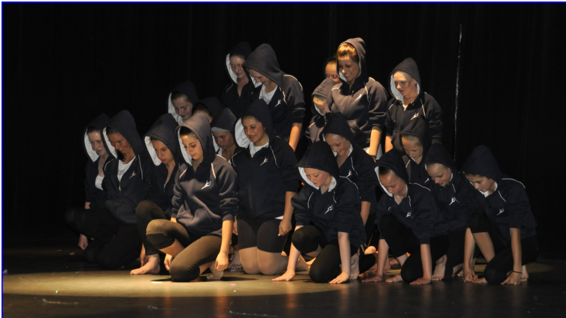
Intermediates at the 2010 End Of Year Concert

If you would like to order either or both of these garments your Team Manager has an order form. Orders need to be placed by the 31st March.